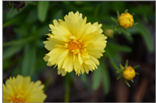
Leading Lady Charlize Tickseed flowers

Leading Lady Charlize Tickseed is recommended for the following landscape applications;