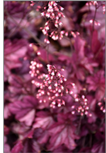
Wild Rose Coral Bells flowers

Wild Rose Coral Bells is a fine choice for the garden, but it is also a good selection for planting in outdoor pots and containers. With its upright habit of growth, it is best suited for use as a 'thriller' in the 'spiller-thriller-filler' container combination; plant it near the center of the pot, surrounded by smaller plants and those that spill over the edges. Note that when growing plants in outdoor containers and baskets, they may require more frequent waterings than they would in the yard or garden.