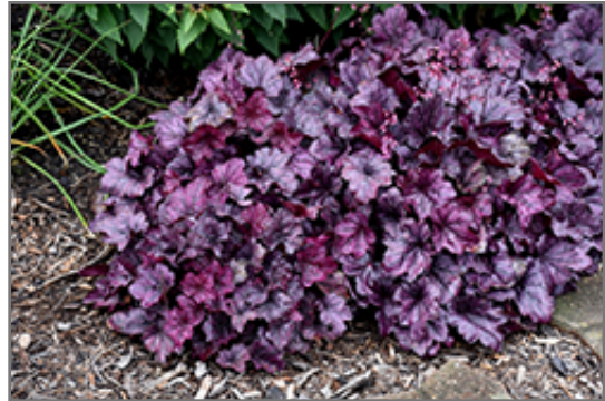
Wild Rose Coral Bells

This is a relatively low maintenance plant, and should be cut back in late fall in preparation for winter. It is a good choice for attracting hummingbirds to your yard. It has no significant negative characteristics.