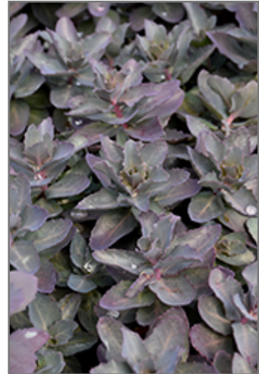
Cherry Truffle Stonecrop foliage

Cherry Truffle Stonecrop is a fine choice for the garden, but it is also a good selection for planting in outdoor pots and containers. It is often used as a 'filler' in the 'spiller-thriller-filler' container combination, providing a mass of flowers and foliage against which the larger thriller plants stand out. Note that when growing plants in outdoor containers and baskets, they may require more frequent waterings than they would in the yard or garden.