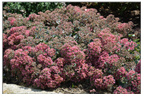
Popstar Stonecrop in bloom