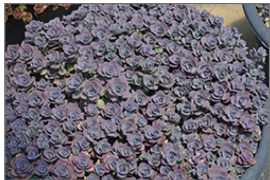
SunSparkler Blue Elf Sedoro