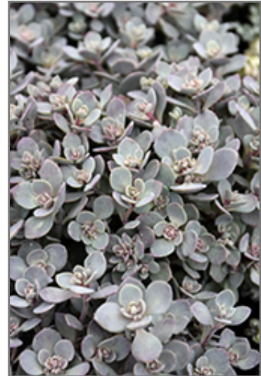
SunSparkler Blue Elf Sedoro foliage

SunSparkler Blue Elf Sedoro is a fine choice for the garden, but it is also a good selection for planting in outdoor pots and containers. Because of its spreading habit of growth, it is ideally suited for use as a 'spiller' in the 'spiller-thriller-filler' container combination; plant it near the edges where it can spill gracefully over the pot. Note that when growing plants in outdoor containers and baskets, they may require more frequent waterings than they would in the yard or garden.