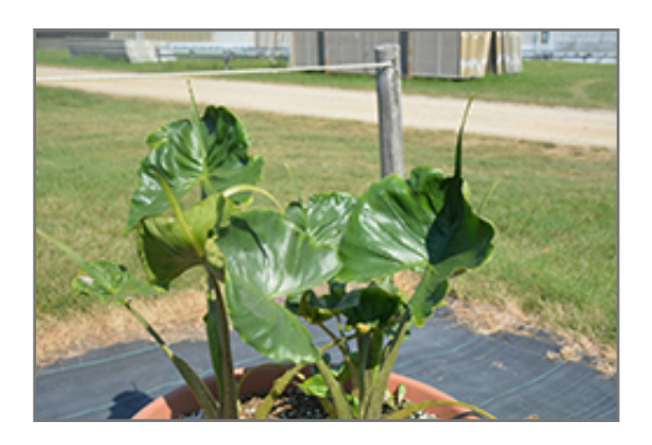
Stingray Elephant's Ear

This is an open herbaceous evergreen houseplant with an upright spreading habit of growth. This plant usually looks its best without pruning, although it will tolerate pruning.