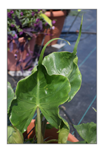
Stingray Elephant's Ear foliage