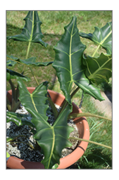
Sarian African Mask foliage

When grown indoors, Sarian African Mask can be expected to grow to be about 6 feet tall at maturity, with a spread of 4 feet. It grows at a medium rate, and under ideal conditions can be expected to live for approximately 5 years. This houseplant will do well in a location that gets either direct or indirect sunlight, although it will usually require a more brightly-lit environment than what artificial indoor lighting alone can provide. It is quite adaptable, prefering to grow in average to wet conditions, and will even tolerate some standing water. The surface of the soil should be kept consistently moist all of the time, and you should expect to water this plant two or more times each week, especially if it's growing in a low-humidity environment. Be aware that your particular watering schedule may vary depending on its location in the room, the pot size, plant size and other conditions; if in doubt, ask one of our experts in the store for advice. It is not particular as to soil type or pH; an average potting soil should work just fine. Be warned that parts of this plant are known to be toxic to humans and animals, so special care should be exercised if growing it around children and pets.