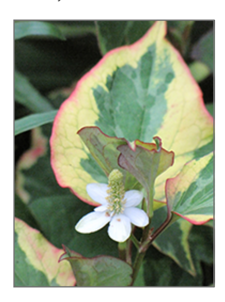
Chameleon Houttuynia flowers