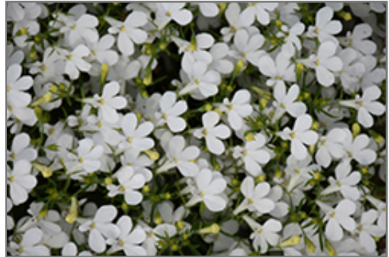
Hot Snow White Lobelia flowers

This variety is covered with long lasting white flowers; excellent performance in summer heat; looks wonderful in mass plantings along borders or in containers