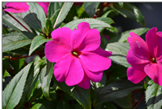
Divine Orchid New Guinea Impatiens flowers