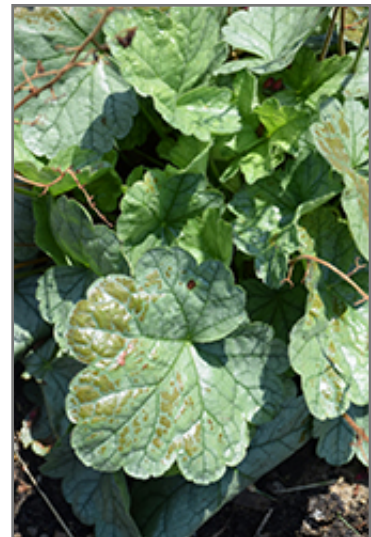
Dolce Spearmint Coral Bells foliage