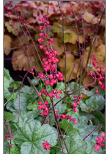
Dolce Spearmint Coral Bells flowers

Dolce Spearmint Coral Bells is recommended for the following landscape applications;