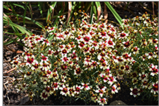
Sizzle And Spice Red Hot Vanilla Tickseed in bloom