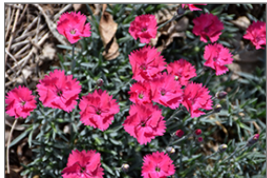
Paint The Town Magenta Pinks flowers