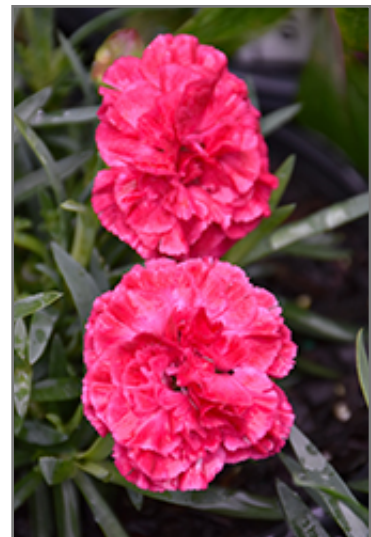
Fruit Punch Raspberry Ruffles Pinks flowers