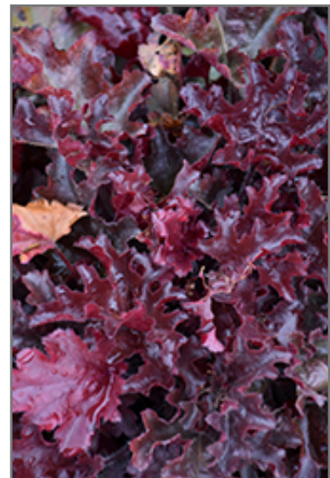
Dolce Cherry Truffles Coral Bells foliage