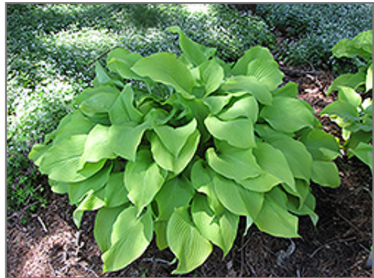
Sun Power Hosta Photo courtesy of NetPS Plant Finder