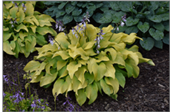
Sun Power Hosta in bloom

Sun Power Hosta is recommended for the following landscape applications;