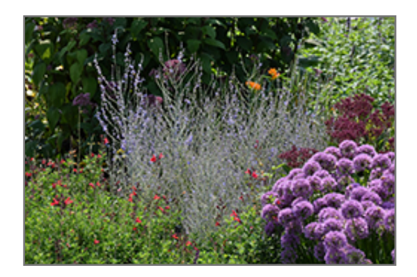
Little Lace Russian Sage in bloom