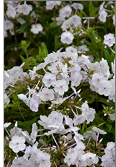
Fashionably Early Crystal Garden Phlox flowers