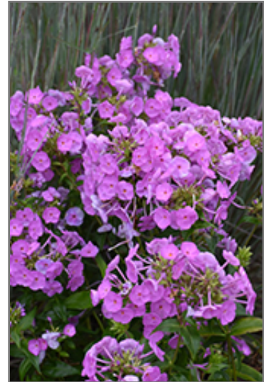
Fashionably Early Flamingo Garden Phlox flowers