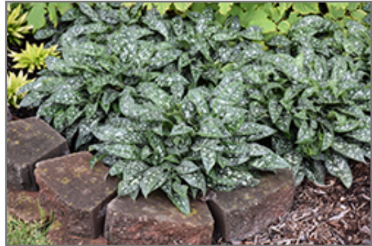
Twinkle Toes Lungwort

Twinkle Toes Lungwort will grow to be about 12 inches tall at maturity, with a spread of 18 inches. When grown in masses or used as a bedding plant, individual plants should be spaced approximately 15 inches apart. Its foliage tends to remain dense right to the ground, not requiring facer plants in front. It grows at a medium rate, and under ideal conditions can be expected to live for approximately 10 years. As an herbaceous perennial, this plant will usually die back to the crown each winter, and will regrow from the base each spring. Be careful not to disturb the crown in late winter when it may not be readily seen!