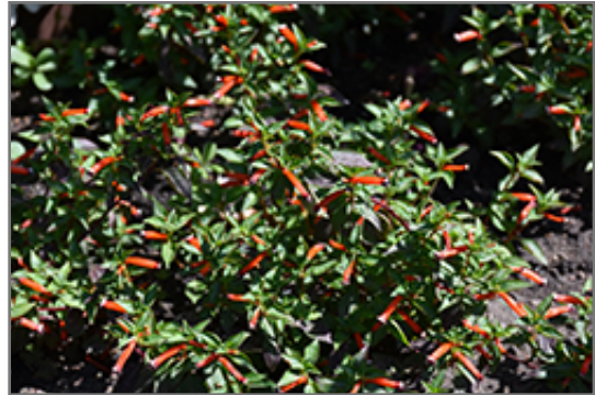
Dynamite Firecracker Plant in bloom