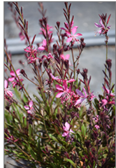
Whiskers Deep Rose Gaura flowers