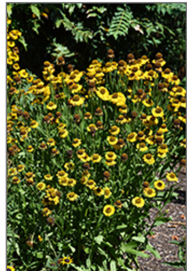
Salud Golden Sneezeweed in bloom