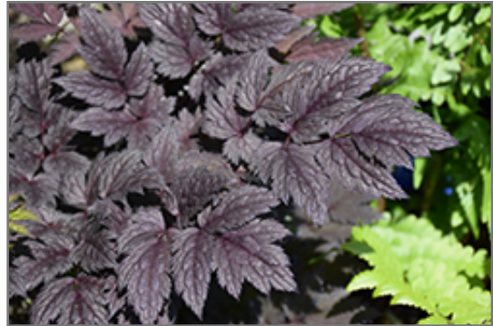
Pink Spike Bugbane foliage