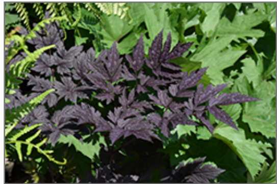
Pink Spike Bugbane foliage