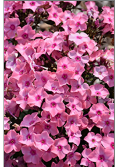
Sweet Summer Queen Garden Phlox flowers