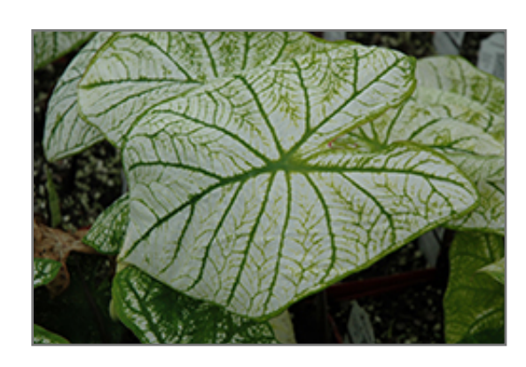
Candidum Caladium foliage

A beautifully refined element to add to a shady site; luminous white leaves have deep green veins and edges; a great garden accent or border edge that will tolerate some sun; an excellent display for containers