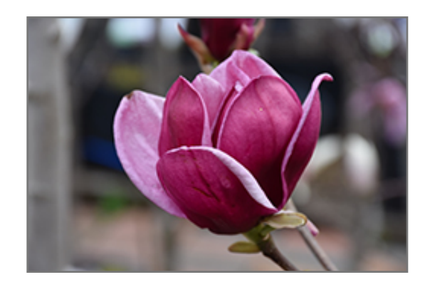
Genie Magnolia flowers