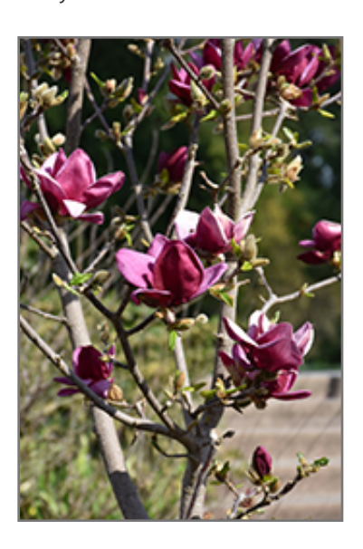
Genie Magnolia flowers