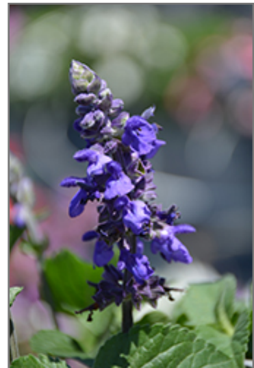
Big Blue Salvia flowers