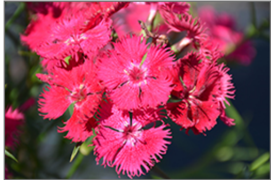
Rockin' Rose Pinks flowers

Rockin' Rose Pinks is recommended for the following landscape applications;