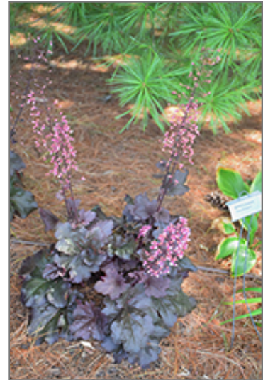
Primo Mahogany Monster Coral Bells in bloom

Primo Mahogany Monster Coral Bells is a fine choice for the garden, but it is also a good selection for planting in outdoor pots and containers. With its upright habit of growth, it is best suited for use as a 'thriller' in the 'spiller-thriller-filler' container combination; plant it near the center of the pot, surrounded by smaller plants and those that spill over the edges. Note that when growing plants in outdoor containers and baskets, they may require more frequent waterings than they would in the yard or garden.