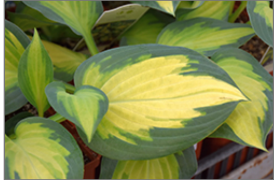
Forbidden Fruit Hosta foliage