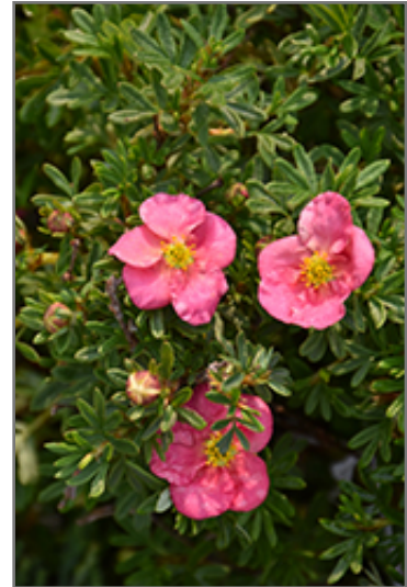
Bella Bellissima Potentilla flowers