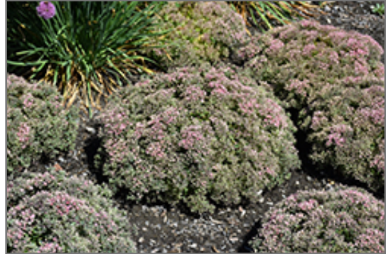
Rock 'N Round Pride and Joy Stonecrop in bloom