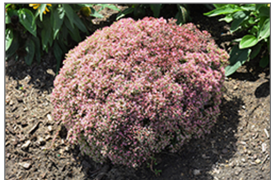
Rock 'N Round Pride and Joy Stonecrop in bloom