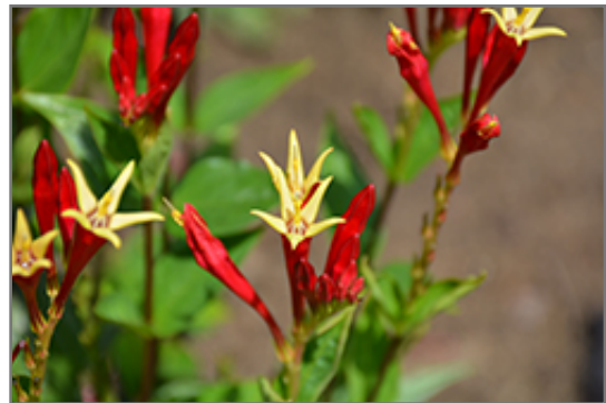
Little Redhead Indian Pink flowers