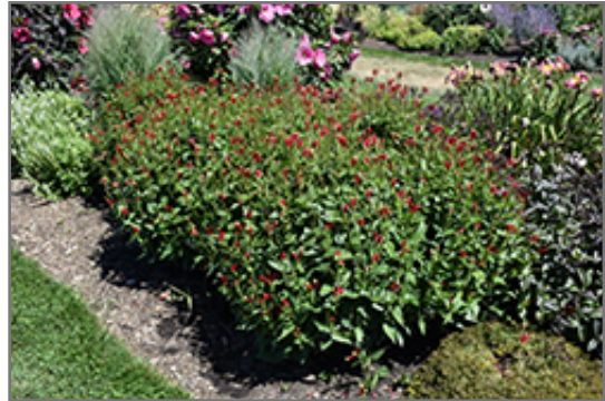
Little Redhead Indian Pink in bloom

Little Redhead Indian Pink is a fine choice for the garden, but it is also a good selection for planting in outdoor pots and containers. With its upright habit of growth, it is best suited for use as a 'thriller' in the 'spiller-thriller-filler' container combination; plant it near the center of the pot, surrounded by smaller plants and those that spill over the edges. Note that when growing plants in outdoor containers and baskets, they may require more frequent waterings than they would in the yard or garden.