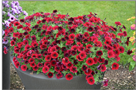
Supertunia Black Cherry Petunia in bloom

Supertunia Black Cherry Petunia is a fine choice for the garden, but it is also a good selection for planting in outdoor containers and hanging baskets. Because of its trailing habit of growth, it is ideally suited for use as a 'spiller' in the 'spiller-thriller-filler' container combination; plant it near the edges where it can spill gracefully over the pot. Note that when growing plants in outdoor containers and baskets, they may require more frequent waterings than they would in the yard or garden.