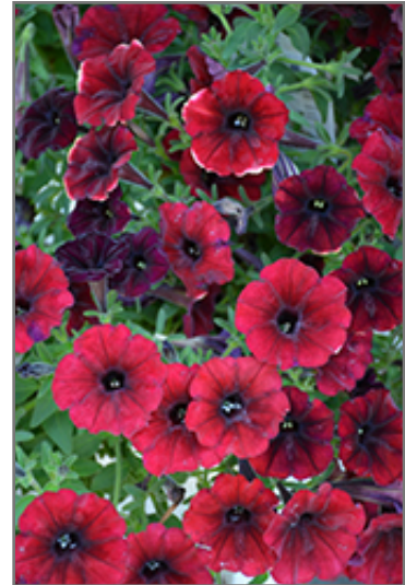
Supertunia Black Cherry Petunia flowers

This plant will require occasional maintenance and upkeep. Trim off the flower heads after they fade and die to encourage more blooms late into the season. It is a good choice for attracting butterflies and hummingbirds to your yard, but is not particularly attractive to deer who tend to leave it alone in favor of tastier treats. It has no significant negative characteristics.