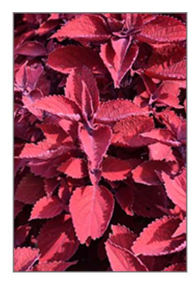
Beale Street Coleus foliage

This is a relatively low maintenance plant. The flowers of this plant may actually detract from its ornamental features, so they can be removed as they appear. Deer don't particularly care for this plant and will usually leave it alone in favor of tastier treats. It has no significant negative characteristics.