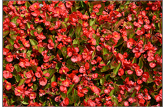
Topspin Scarlet Begonia flowers

Topspin Scarlet Begonia will grow to be about 10 inches tall at maturity, with a spread of 10 inches. When grown in masses or used as a bedding plant, individual plants should be spaced approximately 8 inches apart. Its foliage tends to remain low and dense right to the ground. This annual will normally live for one full growing season, needing replacement the following year.