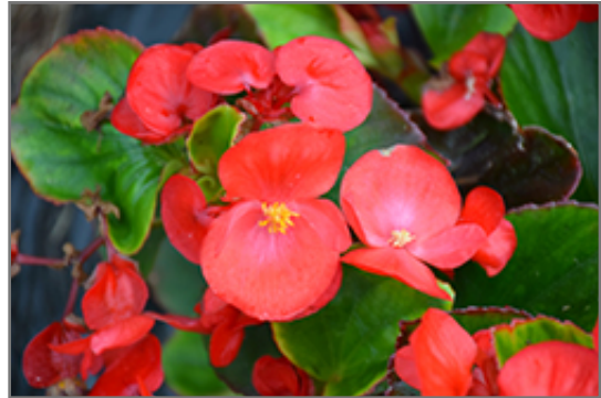
Topspin Scarlet Begonia flowers

Topspin Scarlet Begonia is recommended for the following landscape applications;