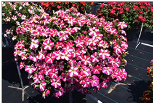
Amore Pink Heart Petunia in bloom

Amore Pink Heart Petunia will grow to be about 12 inches tall at maturity, with a spread of 14 inches. When grown in masses or used as a bedding plant, individual plants should be spaced approximately 10 inches apart. Its foliage tends to remain dense right to the ground, not requiring facer plants in front. This fast-growing annual will normally live for one full growing season, needing replacement the following year.