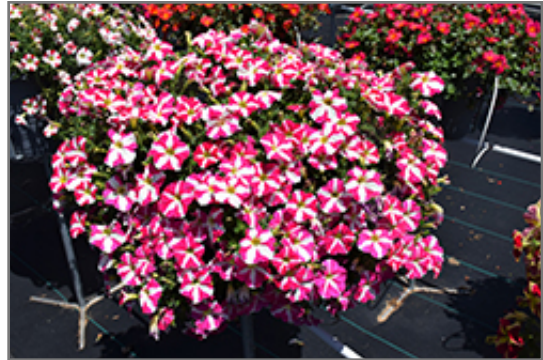
Amore Pink Heart Petunia in bloom

Amore Pink Heart Petunia is a fine choice for the garden, but it is also a good selection for planting in outdoor containers and hanging baskets. It is often used as a 'filler' in the 'spiller-thriller-filler' container combination, providing a mass of flowers against which the thriller plants stand out. Note that when growing plants in outdoor containers and baskets, they may require more frequent waterings than they would in the yard or garden.