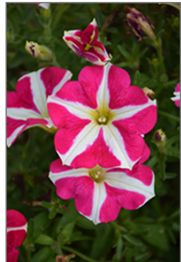
Amore Pink Heart Petunia flowers