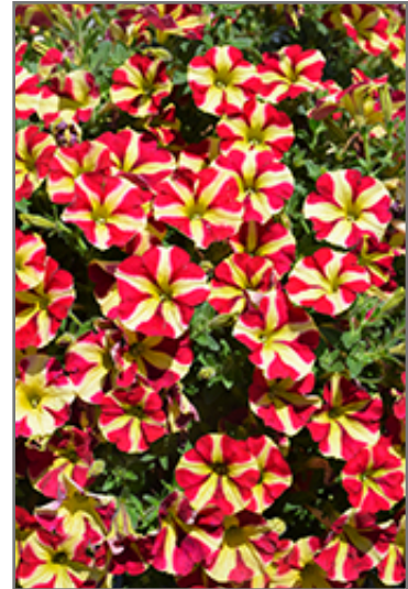
Amore Queen of Hearts Petunia flowers

This plant will require occasional maintenance and upkeep. Trim off the flower heads after they fade and die to encourage more blooms late into the season. It is a good choice for attracting butterflies and hummingbirds to your yard, but is not particularly attractive to deer who tend to leave it alone in favor of tastier treats. It has no significant negative characteristics.