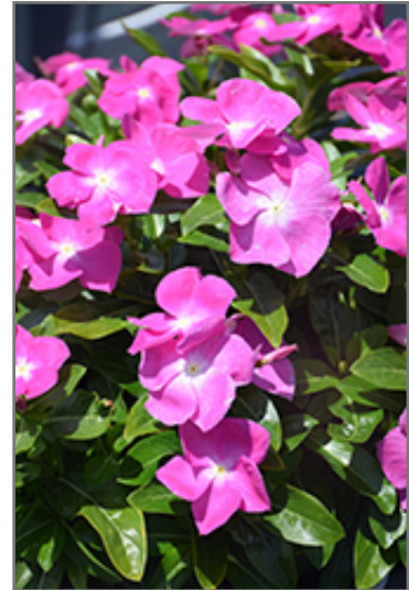
Cora XDR Orchid flowers

This plant will require occasional maintenance and upkeep, and should not require much pruning, except when necessary, such as to remove dieback. It is a good choice for attracting butterflies to your yard, but is not particularly attractive to deer who tend to leave it alone in favor of tastier treats. It has no significant negative characteristics.