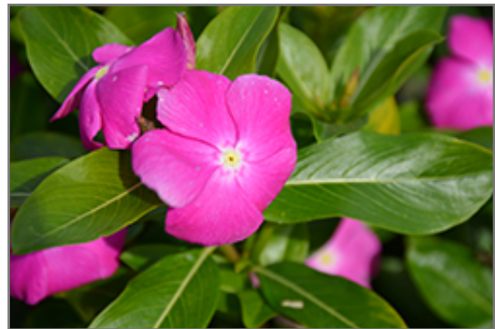
Cora XDR Orchid flowers