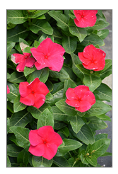
Cora XDR Punch flowers