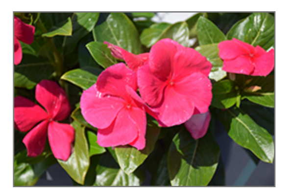
Cora XDR Punch flowers

Cora XDR Punch is recommended for the following landscape applications;