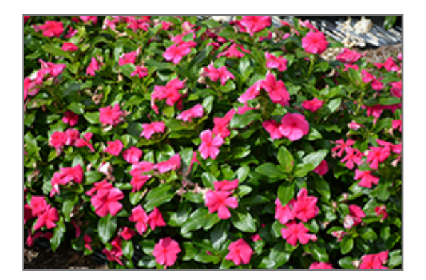
Cora XDR Punch in bloom

Cora XDR Punch will grow to be about 16 inches tall at maturity, with a spread of 20 inches. Its foliage tends to remain dense right to the ground, not requiring facer plants in front. This fast-growing annual will normally live for one full growing season, needing replacement the following year.