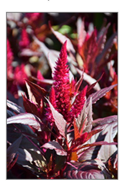
Kelos Fire Magenta Celosia flowers