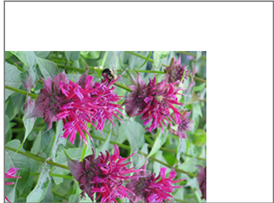
Raspberry Wine Beebalm flowers

Raspberry Wine Beebalm will grow to be about 30 inches tall at maturity, with a spread of 32 inches. When grown in masses or used as a bedding plant, individual plants should be spaced approximately 28 inches apart. It grows at a fast rate, and under ideal conditions can be expected to live for approximately 5 years. As an herbaceous perennial, this plant will usually die back to the crown each winter, and will regrow from the base each spring. Be careful not to disturb the crown in late winter when it may not be readily seen!