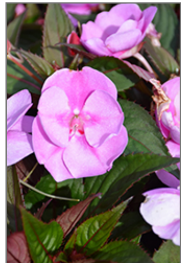
SunPatiens Vigorous Lavender Splash New Guinea Impatiens flowers