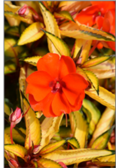
SunPatiens Vigorous Tropical Orange New Guinea Impatiens flowers

This plant will require occasional maintenance and upkeep, and should not require much pruning, except when necessary, such as to remove dieback. It has no significant negative characteristics.