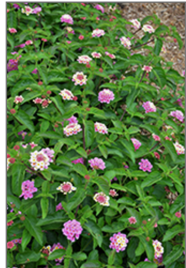
Landscape Bandana Pink Lantana in bloom