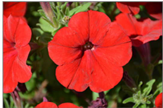
Capella Ruby Red Petunia flowers