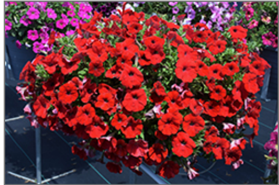
Capella Ruby Red Petunia in bloom

Capella Ruby Red Petunia is a fine choice for the garden, but it is also a good selection for planting in outdoor containers and hanging baskets. It is often used as a 'filler' in the 'spiller-thriller-filler' container combination, providing a mass of flowers against which the thriller plants stand out. Note that when growing plants in outdoor containers and baskets, they may require more frequent waterings than they would in the yard or garden.