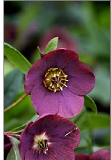
Honeymoon Rome In Red Hellebore flowers

Honeymoon Rome In Red Hellebore is recommended for the following landscape applications;