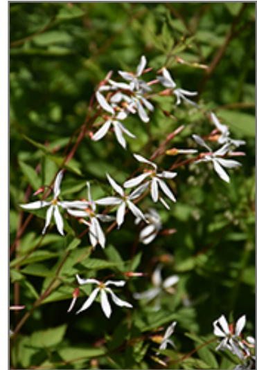
Bowman's Root flowers

Bowman's Root is recommended for the following landscape applications;