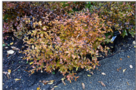
Bowman's Root in fall