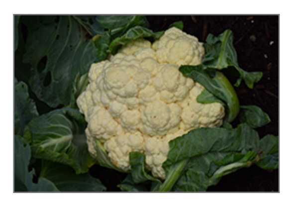
Amazing Cauliflower fruit

Amazing Cauliflower will grow to be about 24 inches tall at maturity, with a spread of 18 inches. When planted in rows, individual plants should be spaced approximately 15 inches apart. This fast-growing vegetable plant is an annual, which means that it will grow for one season in your garden and then die after producing a crop.